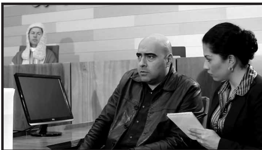
The 'consecutive interpreting' simulation. From left to right: the judge, the accused and the interpreter.