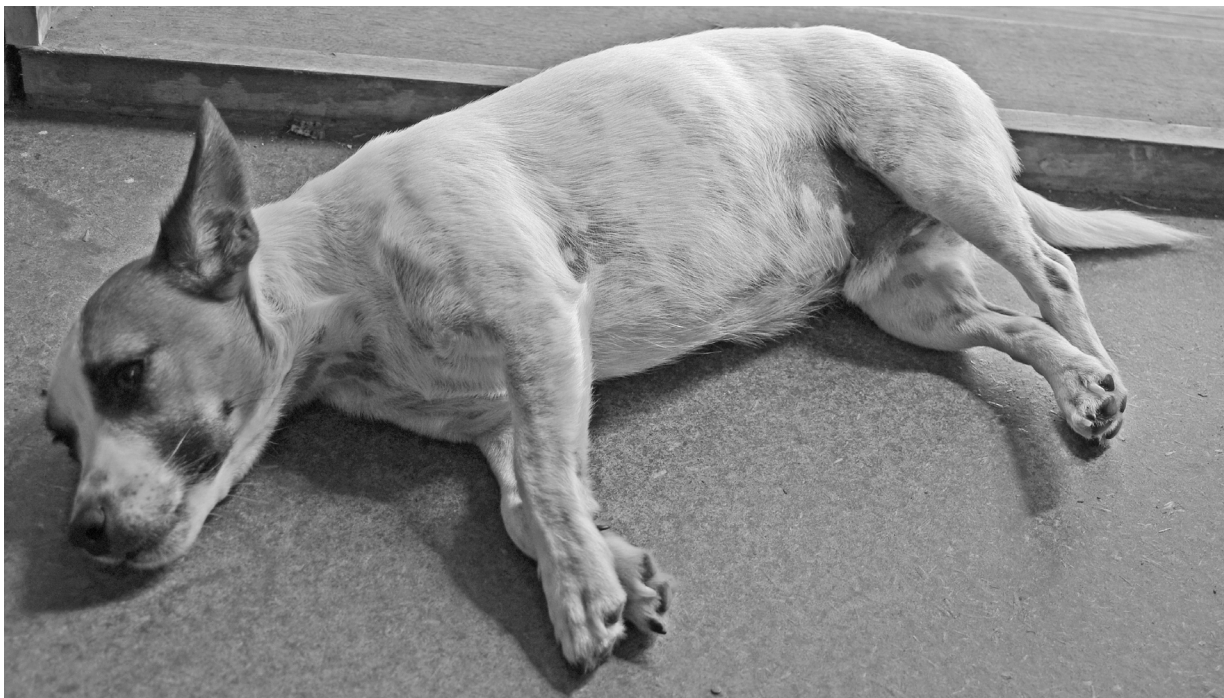
Rex the dog provides greater assistance with translation than any CAT