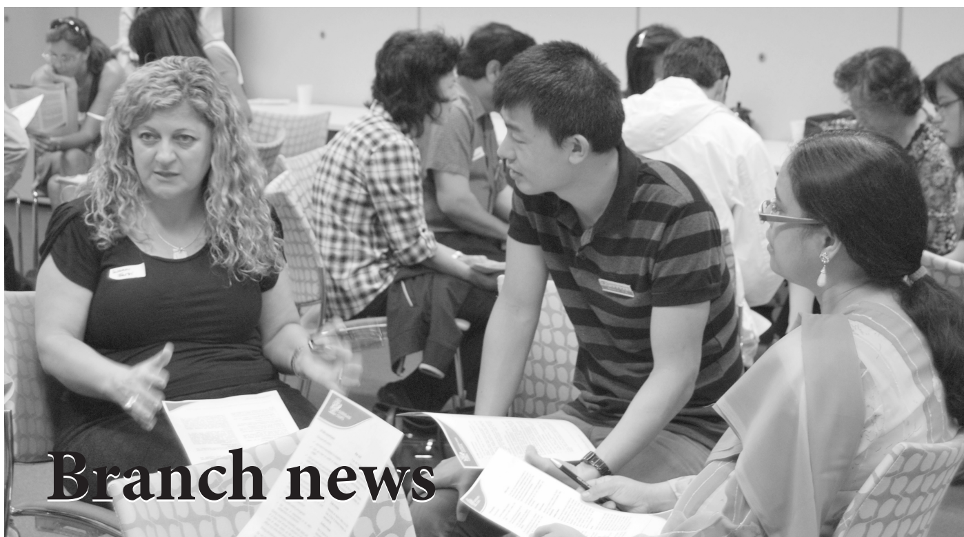
QLD Branch members discuss legal ethics