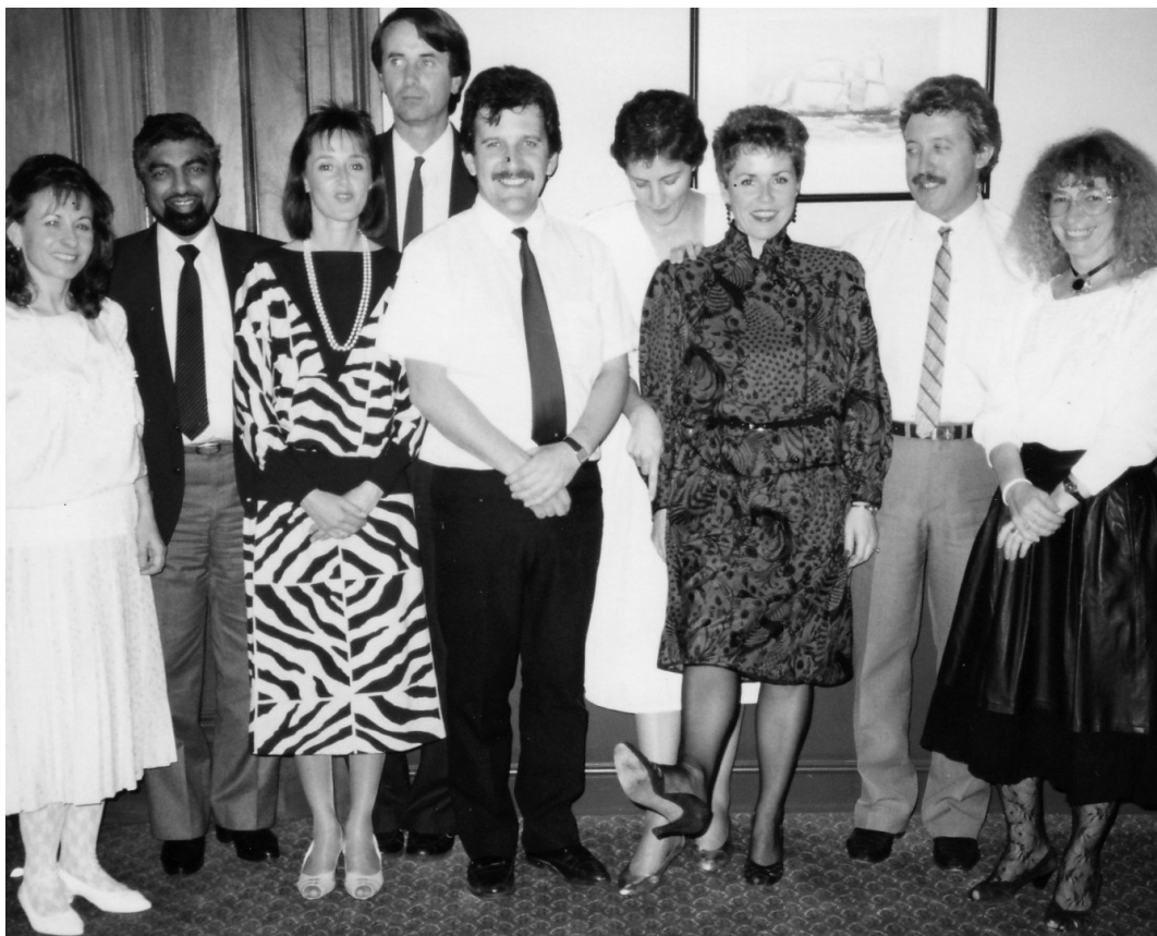
This page: Despite a few fashion mistakes along the way, AUSIT continues to nurture committed, professional representatives. Here are some of the organisation's early flag-bearers at the inaugural Annual General Meeting in Canberra, 1988.