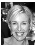
Qld Principal Delegate