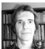
Vic/Tas Principal Delegate