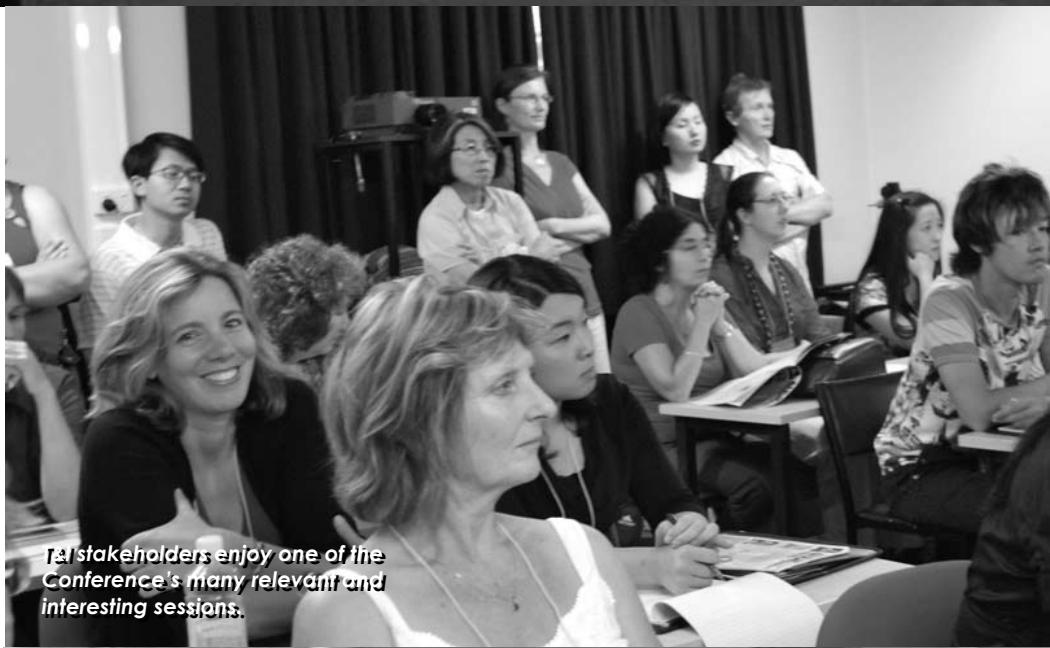
It's stakeholders enjoy one of the Conference's many relevant and interesting sessions.