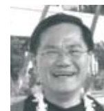
NSW Principal Delegate