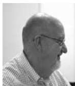
ACT Principal Delegate