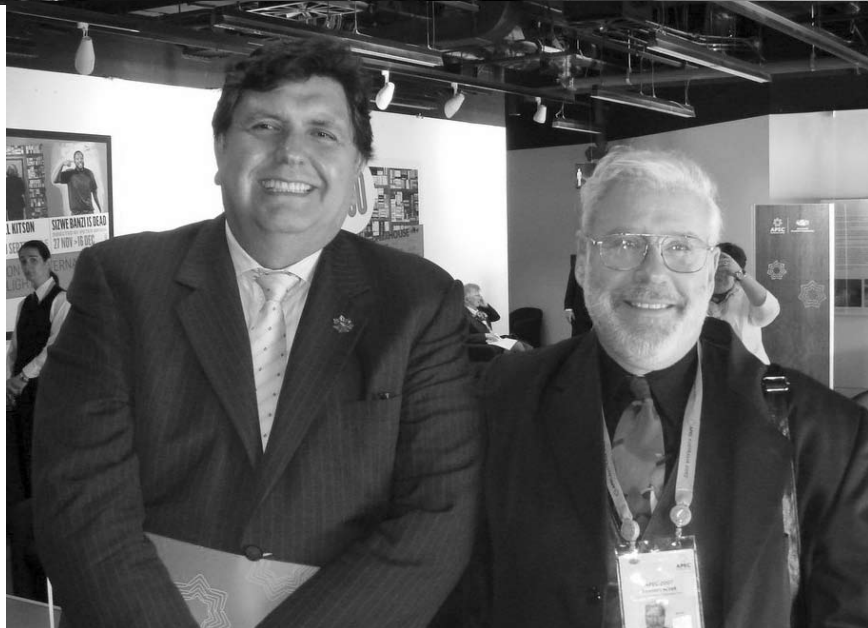
Top: The official APEC leaders photo.