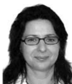
WA Principal Delegate