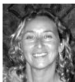
SA/NT Principal Delegate